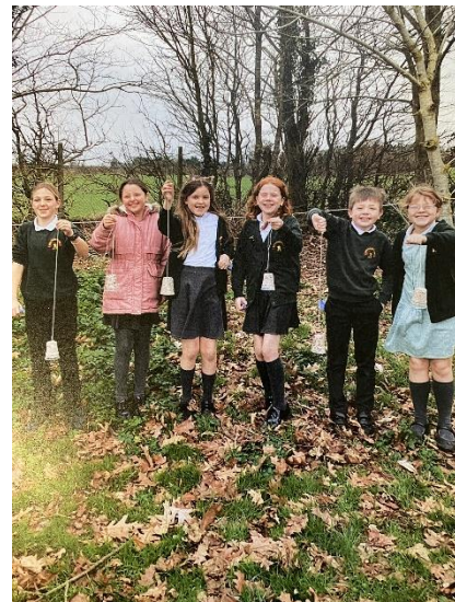
Eco team have made some bird feeders!